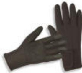
Gloves May be dive type or simple garden gloves