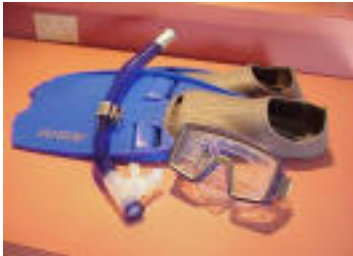
mask, snorkel, fins foot or boot style fins are fine