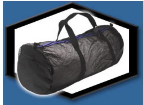
A duffle to hold dive gear